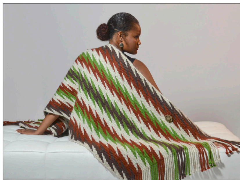
"Finger Woven Shawl" was purchased by the National Museum of the American Indian in Washington, D.C.