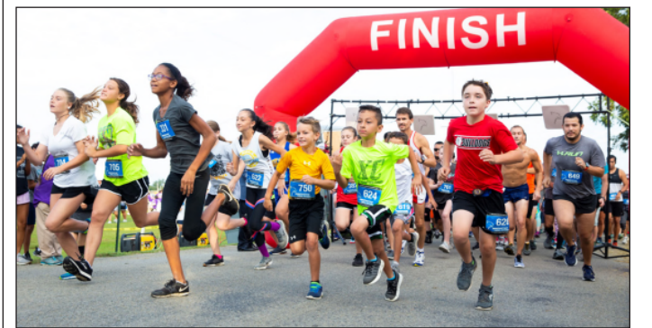
And they're off! Runners take off at the start of the Chickasaw Nation Annual Meeting and Festival 5K. Over 300 participated in the Sept. 28 5K and fun walk at the Tishomingo Wildlife Refuge.