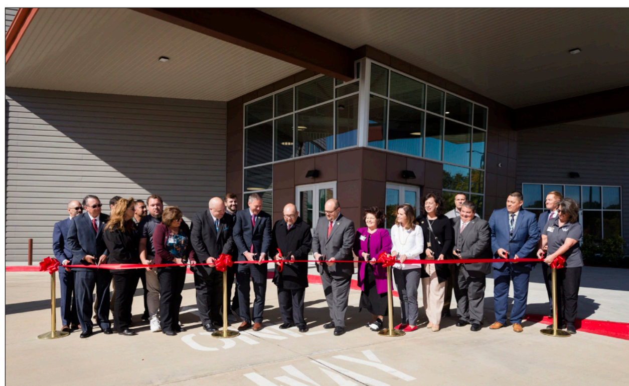
Governor Bill Anoatubby, center with large scissors, is joined by Chickasaw Nation elected officials, Chickasaw citizens, staff and dignitaries during Oct. 16 ribbon cutting ceremonies for the Chickasaw Nation Wellness Center in Ada.

"The building houses the cutting edge in fitness technology and will usher in a new approach to how we exercise. It will help Chickasaws, and others, reach