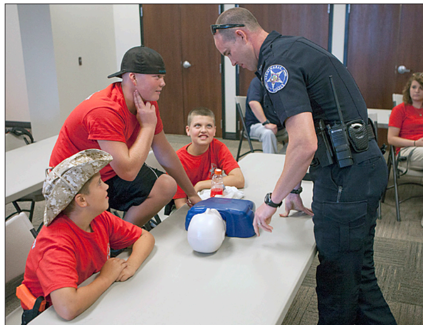
Community outreach and safety is a priority for the Lighthorse Police Department. Officers teach basic CPR during the youth police academy.

lice Department includes specially trained K-9 teams. These teams are tested and trained regularly to track fugitives, participate in patrol (officer protection) work, and perform narcotics detection. K-9 officers and their dogs are a valuable resource in interacting with residents within the communities they serve. Lighthorse K-9 demonstrations are popular at local schools.