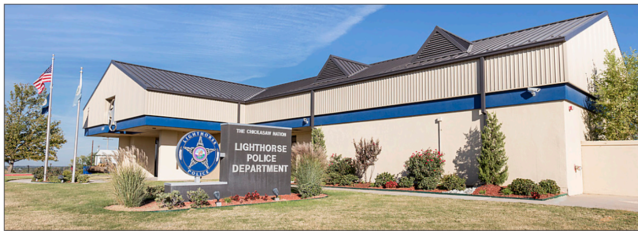
The Chickasaw Nation Lighthorse Police Department headquarters is located in Ada, Okla. The department is split into three precincts: WinStar, Ada and Newcastle.

ADA, Okla. - The Lighthorse Police Department of the Chickasaw Nation prides itself on its highly trained officers and ability to work with local, state and federal agencies to keep Oklahomans safe. Lighthorse officers provide law enforcement services to the Chickasaw Nation and citizens within its jurisdiction, as well as assist city, county and state police. The contemporary Lighthorse Police Department was re-established in 2004.